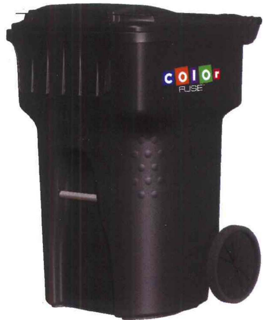
Digital rendering of an Otto 95-gallon Edge roll-out cart with a six color ColorFUSE graphic.

Holtz Industries, Inc. 200 S. Terrace Ct Newark, OH 43055 TF: 1-800-535-0104 Web: www.holtzindustries.com