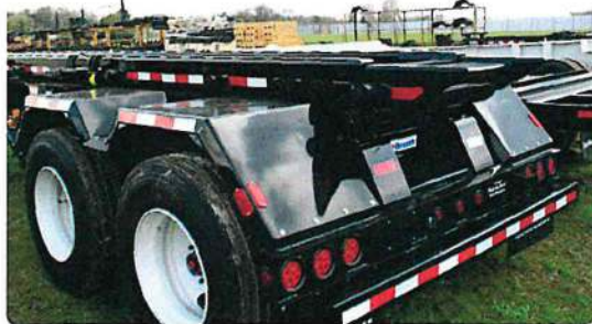
*EX model shown

All Galbreath products are designed to be compliant with ANSI standard container requirements.