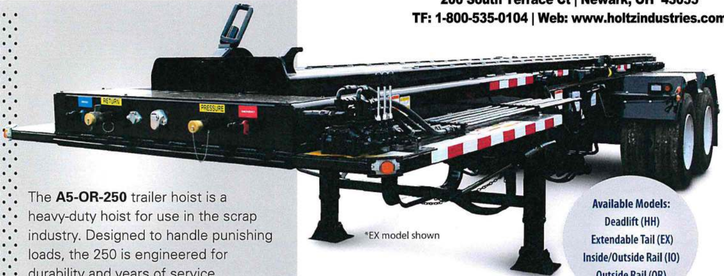
*EX model shown

The A5-OR-250 trailer hoist is a heavy-duty hoist for use in the scrap industry. Designed to handle punishing loads, the 250 is engineered for durability and years of service.