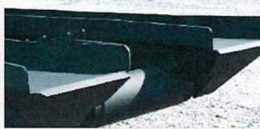
Trough widths (10" most common) and Tail flaring styles available.