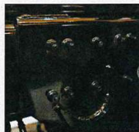
Huck bolted to chassis frames*