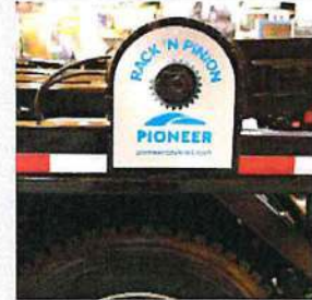
Pioneer tarping systems.