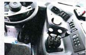
Inside air controls center mounted in ergonomic Power Tower featuring Plug And Play™ wiring. (Top) traditional cab, (bottom) cab over.