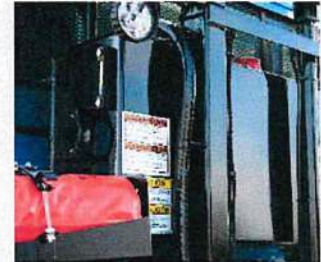
Behind the cab, steel tank with 3 micron return filtration (pictured at left)