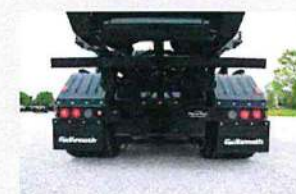
HD rear apron pintle ready with split bumper and LED lighting