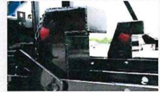
3 styles of moveable stops.

AFCA-TM-24 shown with Pioneer Rack 'n Pinion™, safety hi-vis lighting and move-able Standard Shoe front stop options.