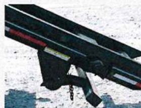
Air Assist Auto Folding ICC Bumper