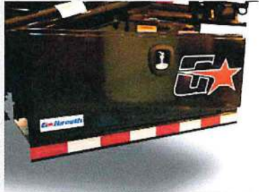
Toolbox styles and sizes.