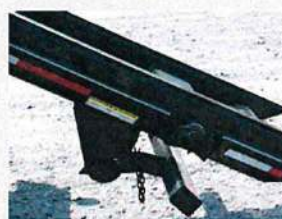
Air assist auto folding ICC bumper