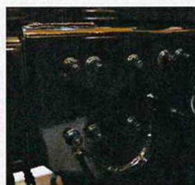
Huck bolted to chassis frames*