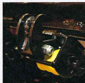
HD nylon ratchet container hold downs