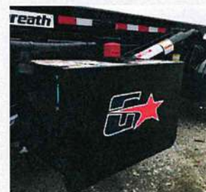
50-gallon steel hydraulic tank side mounted w/ dual sight/temp gauge