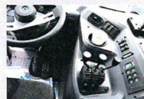
Inside air controls center mounted in ergonomic Power Tower featuring Plug And Play™ wiring. (Top) traditional cab, (bottom) cab over