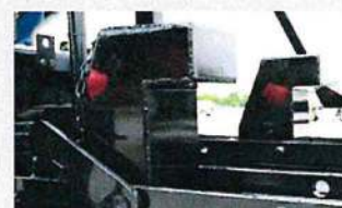
3 styles of moveable stops