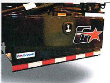
Toolbox styles and sizes