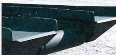
Trough widths (10" most common) and tail flaring styles available