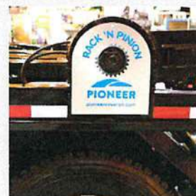
Pioneer tarping systems