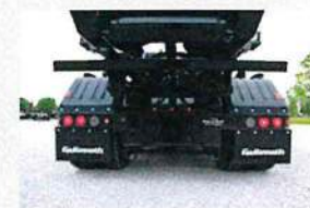
HD rear apron pintle ready with split bumper and LED lighting