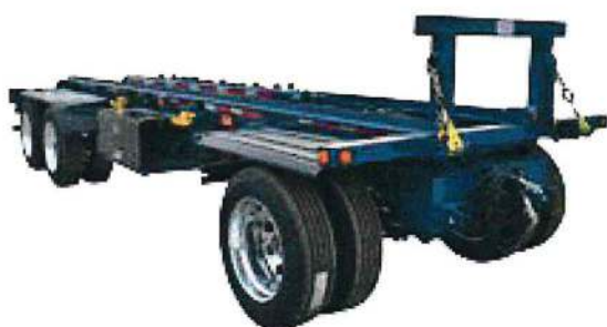
SP3A shown with polished aluminum wheels and special paint options.

(*note – trailer tongue not installed for shipping)