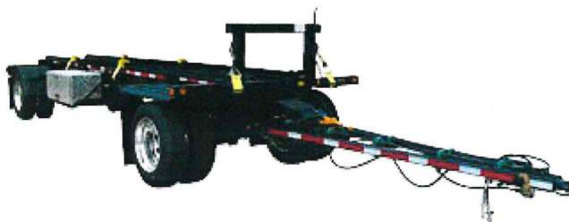
SP2A shown w/ diamond plate toolbox and polished aluminum wheel options.