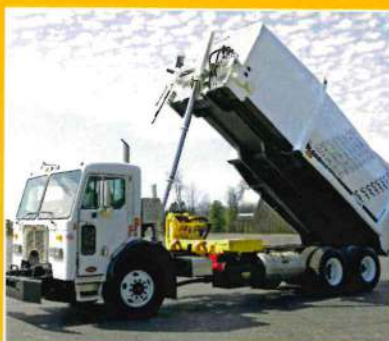
SMOOTH BODY SIDE WALLS NO EXPOSED HYDRAULIC TUBES