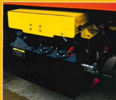
DUAL TOP TANK FILTRATION SYSTEM FILTER CAPACITY 10X INDUSTRY STANDARD