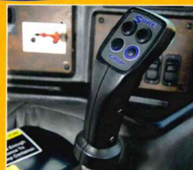
JOY STICK CONTROL OPTION