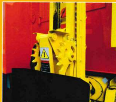
SMOOTH, QUIET OPERATING SPROCKET ARM