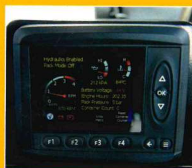
OPERATOR FRIENDLY INTERFACE OPERATOR SPECIFIC SETTING FOR MAXIMUM PERFORMANCE, SPEED AND EFFICIENCY