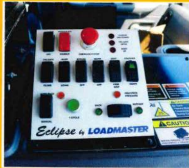
INDUSTRY STANDARD COMMAND CENTER