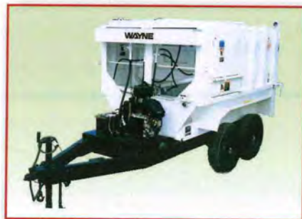
PUP trailer with gas or diesel engine